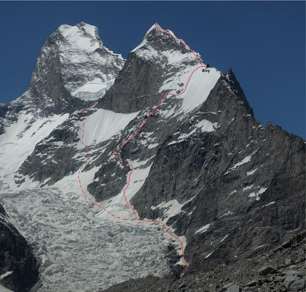
The line of the first ascent of Black Tooth (6719m). ( Simon Messner )

in 2015 while making the first ascent of nearby Changi Tower (6500m) with Scott Bennett. The south-east face weighs in at M6+, WI4, 90° and 2,300m. Swenson calls it 'one of the most complex and difficult routes I have ever climbed,' which is something coming from someone with Swenson's resumé.