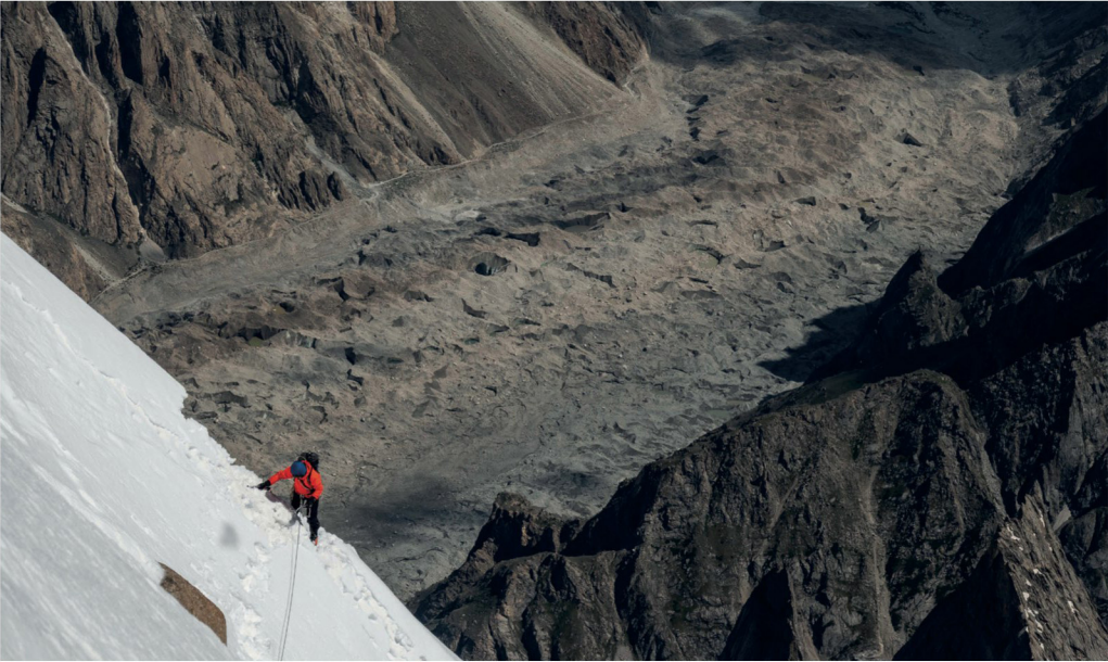
High on Link Sar during the first ascent ( Graham Zimmerman )

taking advantage of a short, three-day weather window to make two new routes climbing in two pairs. While Rolle and Vassière made the first ascent of Sueurs chaudes (150m 6c+ max) Fine and Welfringer discovered an incredibly beautiful and committing line. 'After the first part up easy snow slopes,' Welfringer reported, 'we encountered more difficult terrain with a pitch of ice up to 90° that we graded 5. The following pitch was the crux of the route, I managed to lead this and we estimate M6 with some tricky section past poor pro. Then followed amazing ice pitches were a bit easier but still really sustained up to the final ridge.' See Nepal notes for Welfringer's success on Tengi Ragi Tau.